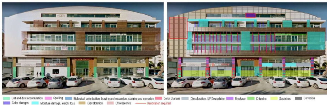
Figure 5. Facade of the building (on the left), facade of the building in 30 years (on the right).

Because of the location of the facade, air pollution may cause wet deposition where there is no rain-wash. This may cause gypsum crust (Agnes et al. 2012). Observations after the rain showed that, some part of the ceramics dry longer than the other parts. Condensation can lead to mold growth, noxious odors and deterioration of building finishes of the panels (Campante and Paschoal, 2002). Biological activity would be seen on the cracks of the ceramics (Agnes et al. 2012). Cracking occurs when thermal movement isn't provided (Goldberg, 2002).