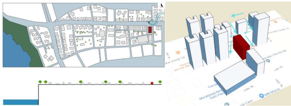
Figure 3. The site plan, the section of the site (on the left) and dominant wind direction and the movement around the building (on the right).