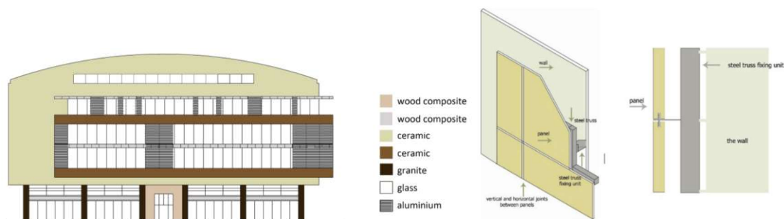
Figure 4. Facade materials of the building and the structure system of the materials.

The six-storey office building is three years old. It has a rectangular form with the dimensions of 42.50 meters to 18.95 meters. The height of the building is 18.60 meters. The facade materials of the modern designed building are ceramic, aluminum, glass, granite and wood composite (Figure 4). The properties of the materials can be seen on Table 1.