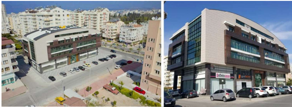
Figure 2. East facade of the building.

The building is located on the intersected corner of Portakal Çiçeği street and 1460 street in Antalya, Turkey. It is a seven storey-high residential building on the right with a distance of 8.40 meters, ten storey-high residential building on the back with a distance of 14 meters and front with a distance of 40 meters and two storey-car parking on the southwest with a distance of 21.5 meters. The main entrance faces to east (Figure 2). This facade always takes the sun directly without having any shading areas. The temperature and the light play a crucial role on materials. 1460 street and Portakal Çiçeği street have intense traffic. This causes air pollution which may create deterioration. The distance from the sea is 1 km and the height of the building from the sea is 22.5 m. The pedestrian roads and the vegetation around the building can be seen in Figure 3. There is an open area in front of the main facade. There are also car parking areas on the east and the west facade.