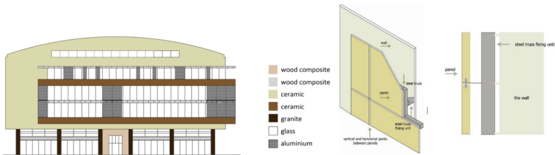
Figure 4. Facade materials of the building and the structure system of the materials.

The six-storey office building is three years old. It has a rectangular form with the dimensions of 42.50 meters to 18.95 meters. The height of the building is 18.60 meters. The facade materials of the modern designed building are ceramic, aluminum, glass, granite and wood composite (Figure 4). The properties of the materials can be seen on Table 1.