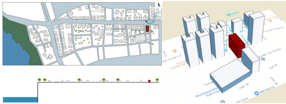
Figure 3. The site plan, the section of the site (on the left) and dominant wind direction and the movement around the building (on the right).