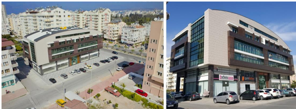
Figure 2. East facade of the building.

The building is located on the intersected corner of Portakal Çiçeği street and 1460 street in Antalya, Turkey. It is a seven storey-high residential building on the right with a distance of 8.40 meters, ten storey-high residential building on the back with a distance of 14 meters and front with a distance of 40 meters and two storey-car parking on the southwest with a distance of 21.5 meters. The main entrance faces to east (Figure 2). This facade always takes the sun directly without having any shading areas. The temperature and the light play a crucial role on materials. 1460 street and Portakal Çiçeği street have intense traffic. This causes air pollution which may create deterioration. The distance from the sea is 1 km and the height of the building from the sea is 22.5 m. The pedestrian roads and the vegetation around the building can be seen in Figure 3. There is an open area in front of the main facade. There are also car parking areas on the east and the west facade.