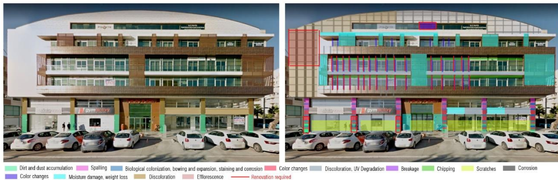
Figure 5. Facade of the building (on the left), facade of the building in 30 years (on the right).

Because of the location of the facade, air pollution may cause wet deposition where there is no rain-wash. This may cause gypsum crust (Agnes et al. 2012). Observations after the rain showed that, some part of the ceramics dry longer than the other parts. Condensation can lead to mold growth, noxious odors and deterioration of building finishes of the panels (Campante and Paschoal, 2002). Biological activity would be seen on the cracks of the ceramics (Agnes et al. 2012). Cracking occurs when thermal movement isn't provided (Goldberg, 2002).